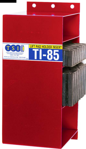
TI-85 Lift Pad Holder