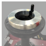
WS0055 16" Dually/Ag adapter