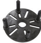
CHROME CLAD ADAPTER For use with wheels with a chrome, or plastic face.