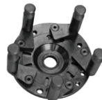
VSG1000A158 Universal flange for reverse, and chrome clad wheels