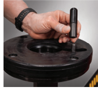
PIN PROTECTORS for centering pulling unit