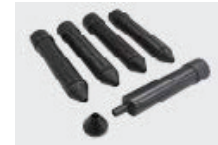
VSG1000A102 5 stud kit / 110mm long For reverse wheels with extra deep spokes. For use with VSG1000A158