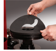
RUBBER PLATE INSERT Turntable guard adds protection to reverse mount wheels.