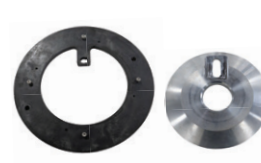
WS0046 10 lug 19.5" wheel adapter