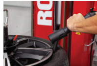
INTEGRATED BEAD SEATER PATENTED TOP INFLATION Safe tubeless bead blast tire inflation system works on any rim diameter.